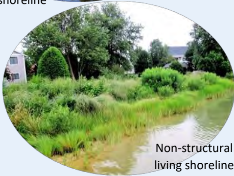
Non-structural living shoreline