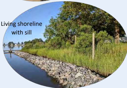
Living shoreline with sill