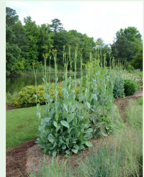
Giant coneflower ( Rudbeckia maxima ) at the Reedville Shoreline Garden